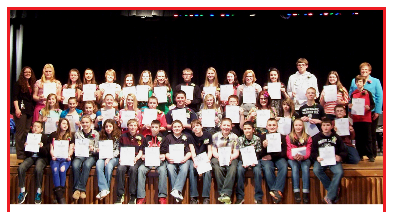
The Holley Chapter of the National Junior Honor Society welcomed 41 new inductees recently.